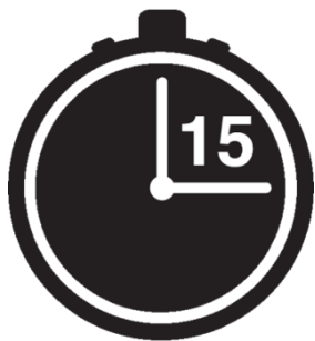
Express PCs – 6

You can log on to these PCs for up to 15 minutes – just enough time to scan a document, check your emails or print your work. They are located in the Quiet Zone.