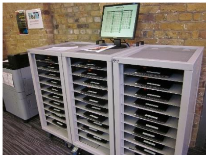
Laptops – 70