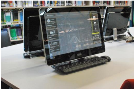
PCs – 400